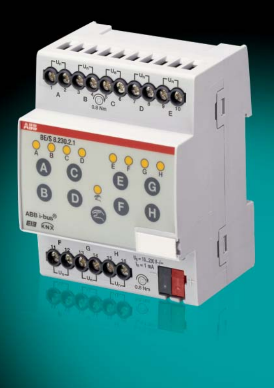
ABB i-bus® KNX Binary Input BE/S Product Information